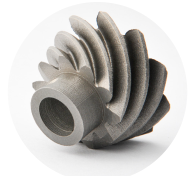
316L Printed Part

Note: Preferred part size <50 x 50 x 25mm. Parts up to 150 x 150 x 150mm are subject to engineering review.